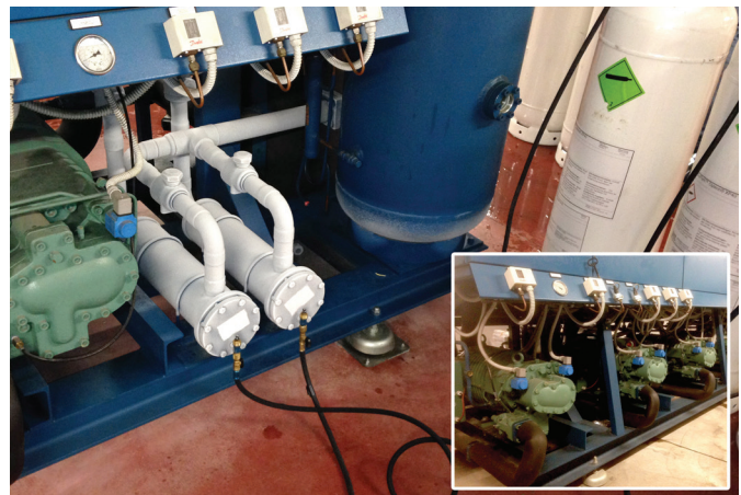
A medium temperature (MT) refrigeration rack from a R-404A/CO 2 hybrid system in a supermarket in Milan was converted to Opteon™ XP40 (R-449A).

(>10.2 kg of R-404A). This will effectively ban the use of virgin R-404A (GWP = 3922) for commercial applications and therefore users of R 404A will have to find an acceptable alternative or rely on the uncertainty of the availability of recycled/reclaimed R-404A.